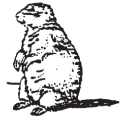
_____ Prairie dog